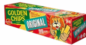
GOLDEN CHIPS Original