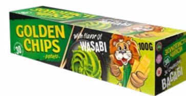
GOLDEN CHIPS With Flavor of Wasabi