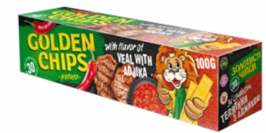
GOLDEN CHIPS With Flavor of Veal with Adjika